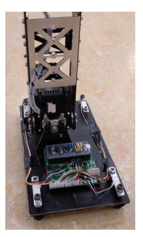
Fig. 1a: The hardware implementation of the ForceFoot. In each of the four corners of the foot, a load cell sensor is mounted. The sensor data is collected and fed into the Dynamxel bus system by an STM32F103 with an external analog to digital converter.